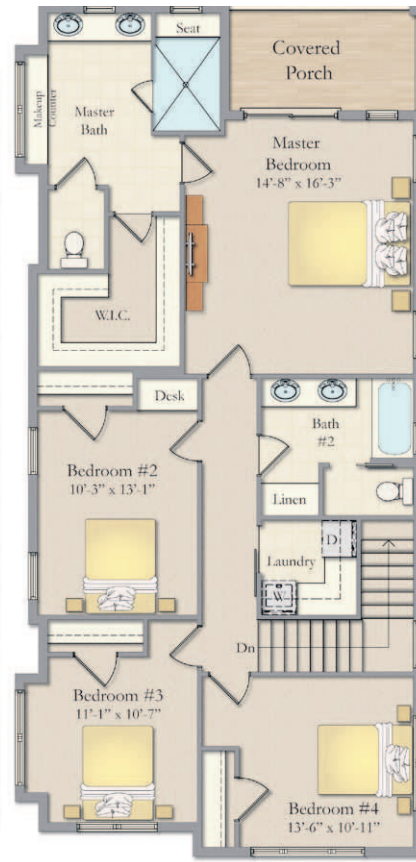
Second Floor 1,275 sq.ft

There's no shortage of curb appeal for this stunning Craftsman design! This design offers relaxed living and plenty of thoughtful touches. The contemporary open layout flows from the great room to the island kitchen and into the casual dining area. A walk-in pantry makes it easy to keep groceries organized, while a family foyer keeps things tidy with a coat closet and handy bench. Other highlights we love include the covered rear porch, large master suite, flexible den, and the convenient laundry located on the second level.